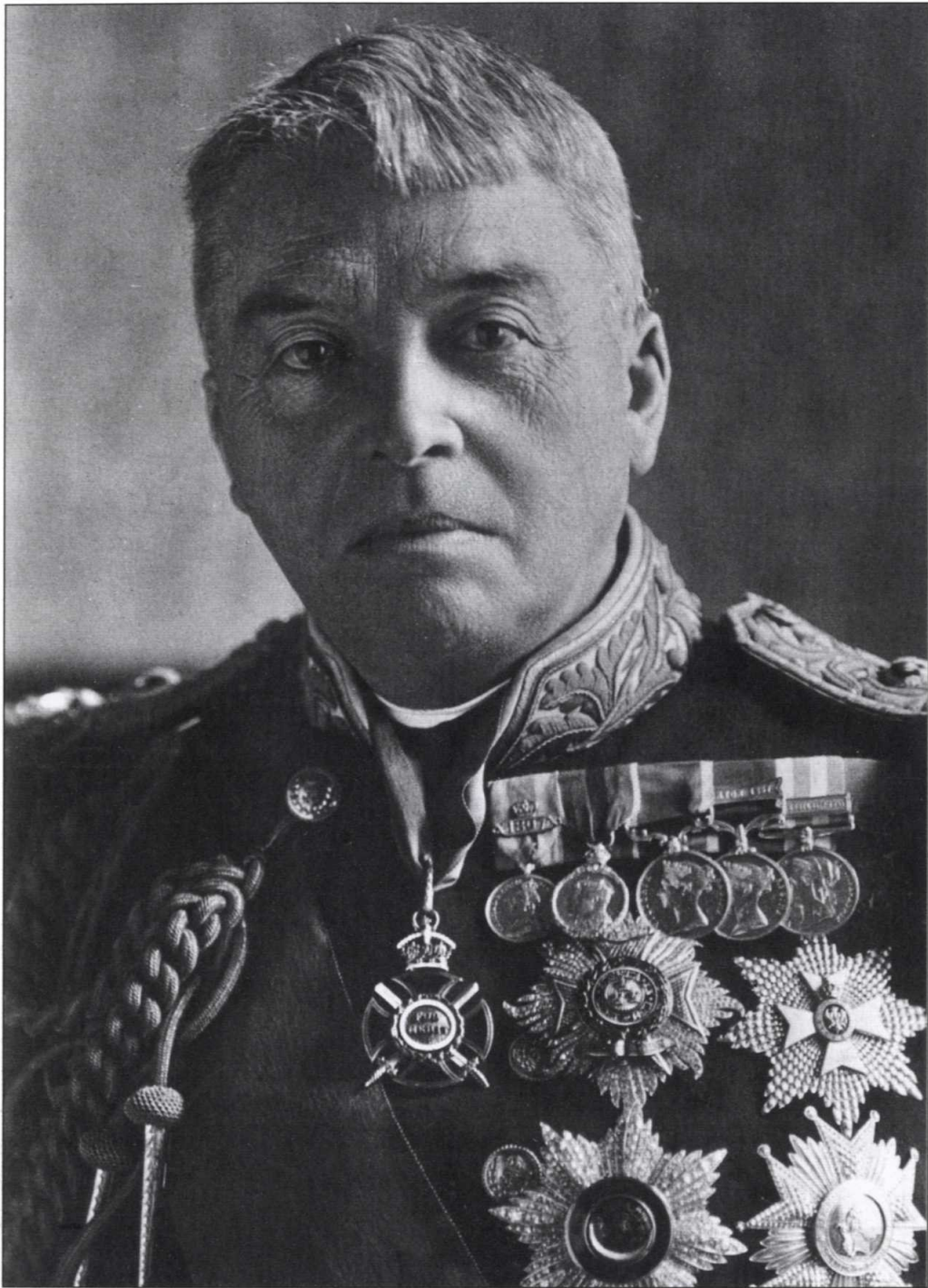
Jackie Fisher, First Sea Lord at the Admiralty, who dragged the Royal Navy kicking and screaming into the twentieth century. Although he regarded submarines principally as localised defensive weapons, he at least recognised their potential, unlike many of his contemporaries. His enemies, and there were many, scathingly dismissed submarines as 'Fisher's toys'.